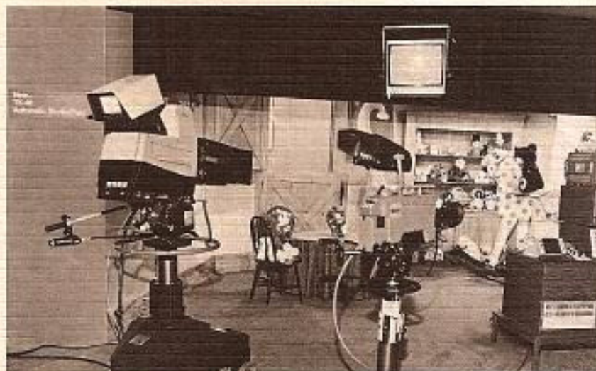
TK-48 Automatic and TKP-47 Portable Automatic on-set

The viewfinder acts as a display, to label the function for each key. The keys allow a camera operator to select different positions for picture boxes, cross hair, cursor, and filter wheel positions. All displays are stored in digital memory. In addition, the safe title/safe action areas can be customized with the electronic screwdriver.