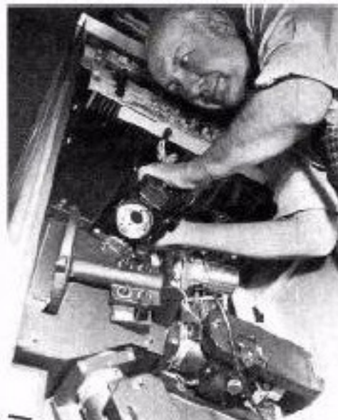
New Precision yoke assembly for TK-29 Cameras.

The TK-29 Series cameras also feature high performance aperture correction and contour enhancement circuitry to bring fine details in the picture, and fully automatic color correction to handle film color balance and exposure problems. Aperture correction is separately adjustable for H and V. Contour correction is applied by linear addition to the luminance signal which maintains picture