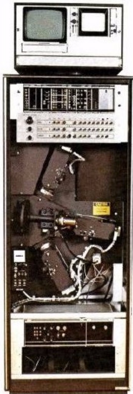
Inside the TK-29C, with the door removed.

Three different models are offered in the TK-29 Series of photo-conductive telecine cameras: